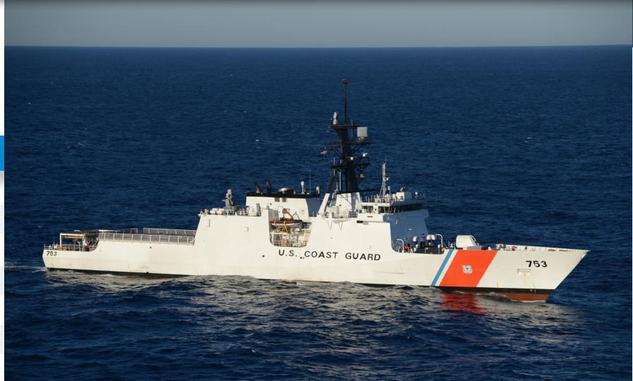
Coast Guard Cutter Hamilton (WMSL 753)