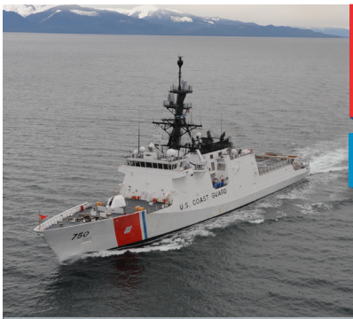
Coast Guard Cutter Bertholf (WMSL 750)