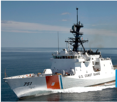
Coast Guard Cutter Waesche (WMSL 751)