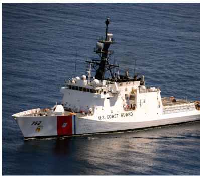
Coast Guard Cutter Stratton (WMSL 752)