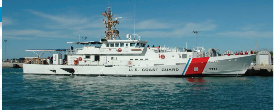
Coast Guard Cutter William Trump